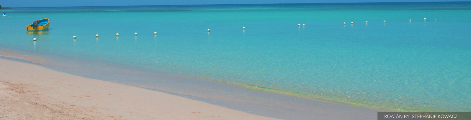
ROATÁN