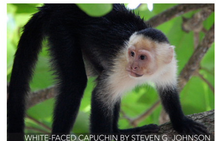
WHITE-FACED CAPUCHIN